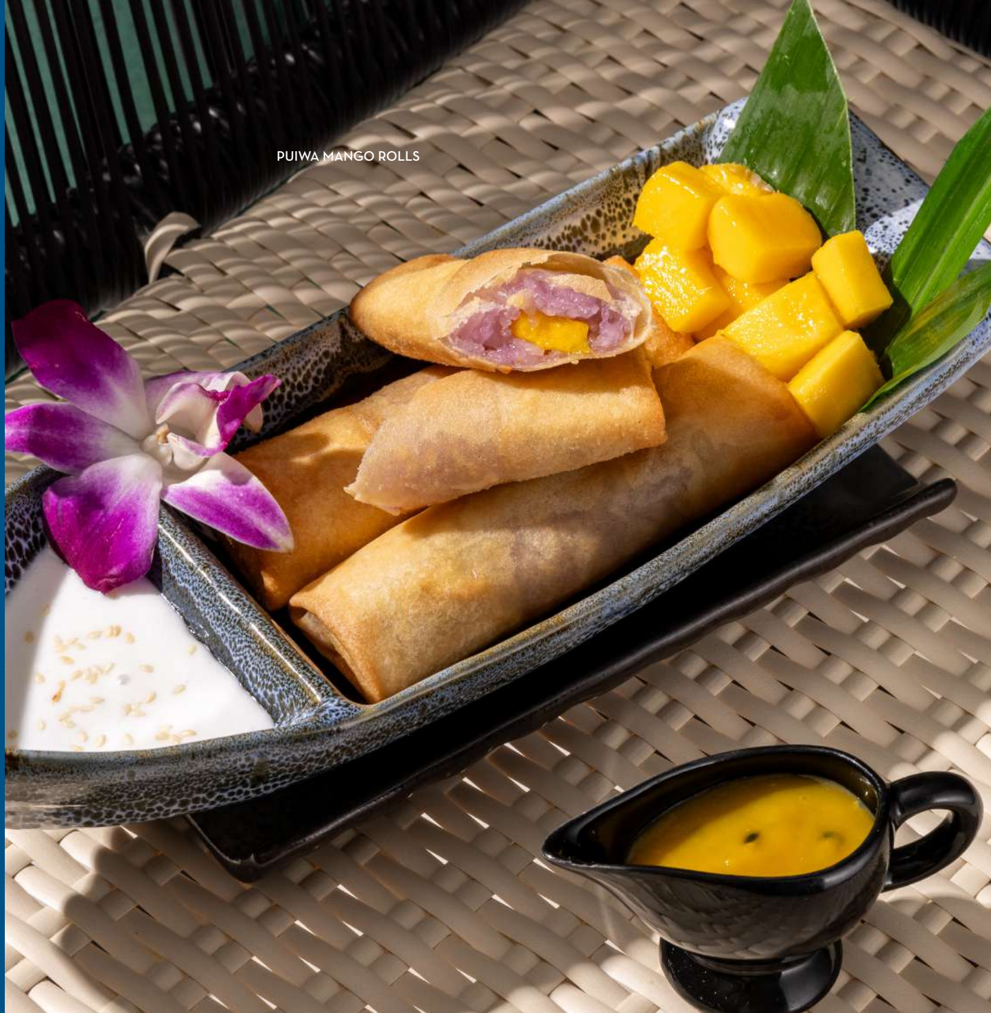
PUIWA MANGO ROLLS