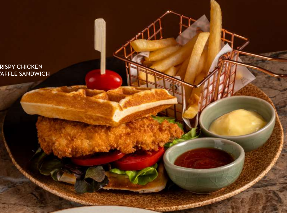
CRISPY CHICKEN WAFFLE SANDWICH