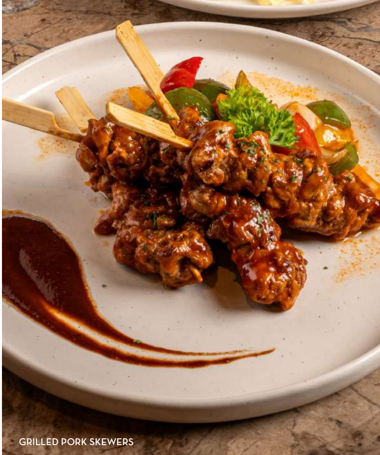
GRILLED PORK SKEWERS