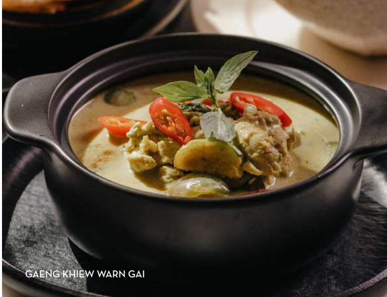
GAENG KHIEW WARN GAI