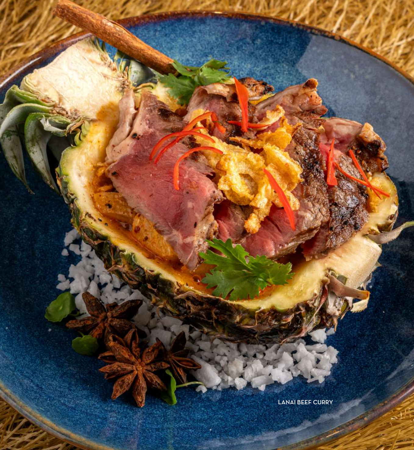
LANAI BEEF CURRY