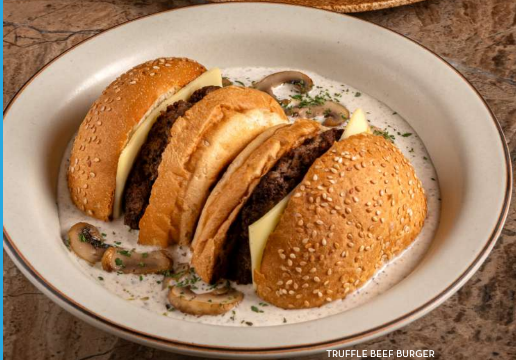
TRUFFLE BEEF BURGER