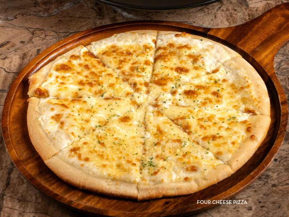
FOUR CHEESE PIZZA